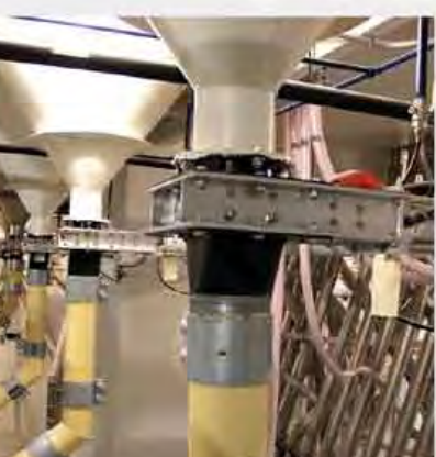
6" (152mm) Roller Gate below hopper handling flour