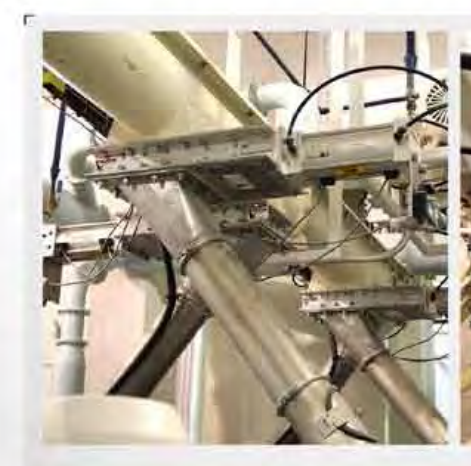
13" (330mm) Roller Gate below a screw conveyor