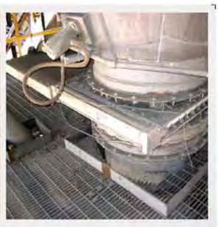
26" (660mm) Dual Cylinder Roller Gate

For a complete list of specifications, modifications, dimensional drawings and measurements, visit WWW.VORTEXVALVES.COM