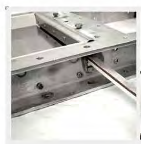
The bonnet seals can be replaced while in-line to decrease downtime